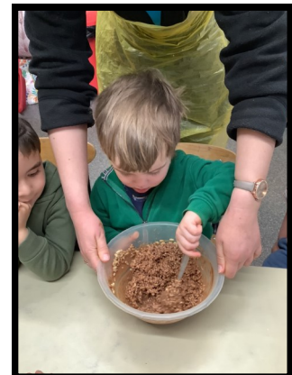
Making some Easter treats.