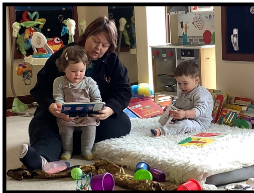
Enjoying a story.