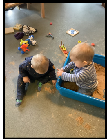
Sand tray fun.