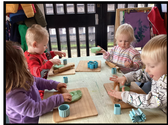
Rolling and cutting shapes in the dough.