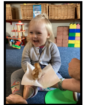
Saying hello to the chicks.