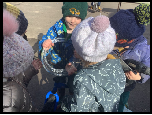
Exploring the ice we found.