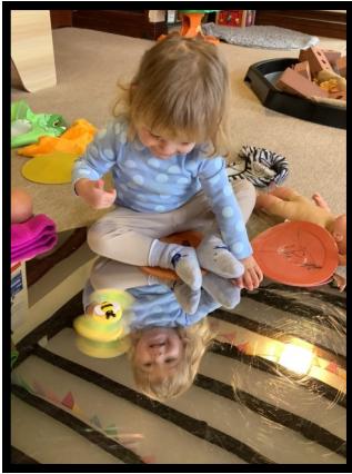
Enjoying looking at my reflection!