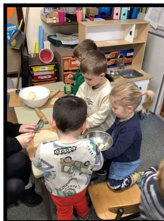
Busy time in Little Squirrels Bakery.