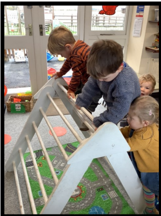
Up and over!