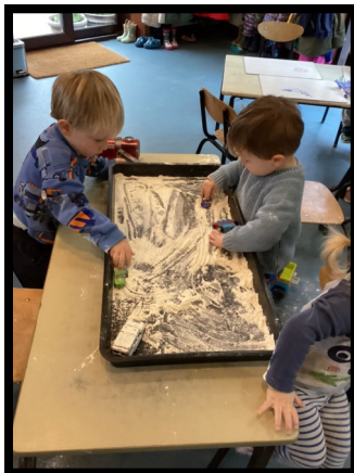
Creating marks in the flour with vehicles.