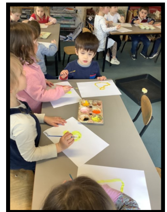
Creating our real life chick pictures.