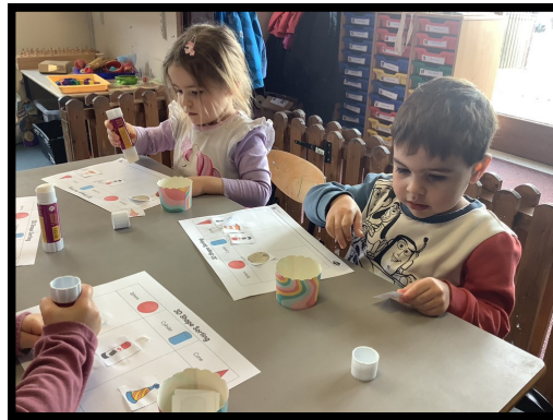
Looking at 3D shapes.