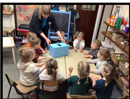
What's in the box?