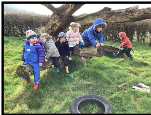
Fun in the meadow on the climbing tree.