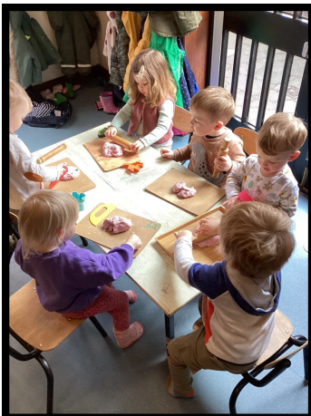
Rolling and cutting the play dough.