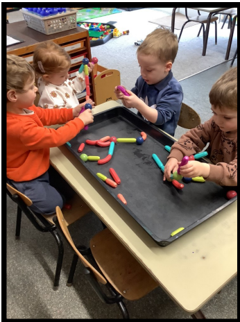
Getting creative with the magnets.