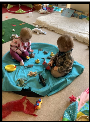
Playing in the Under the Sea sensory tray.