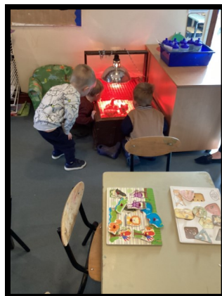
Keeping an eye on Nursery chicks.