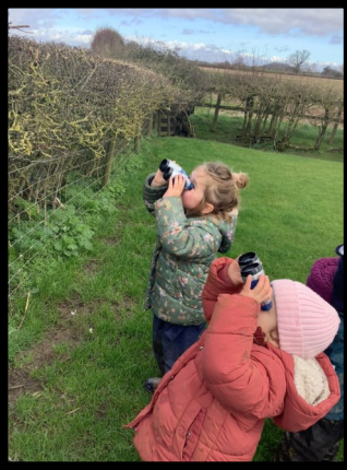
Looking for signs of spring.