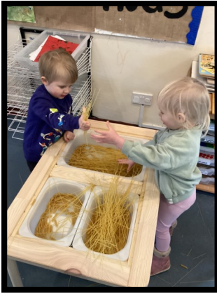
Exploring the pasta sensory tray.