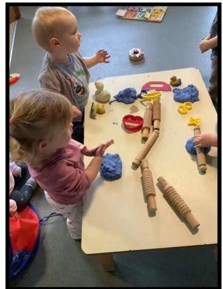
Exploring the play dough.