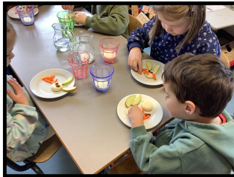
Creating Easter Bunnies for our snack.