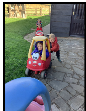
Giving our friends a helping hand.