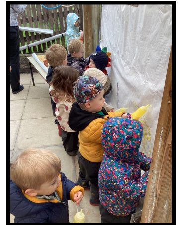
Creative fun with the paint.