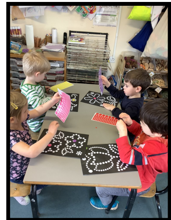
Using sticky shapes to create our pictures.