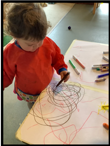
Exploring with colours and marks.