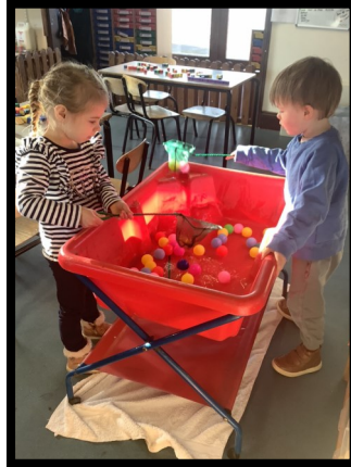
Water tray fun.