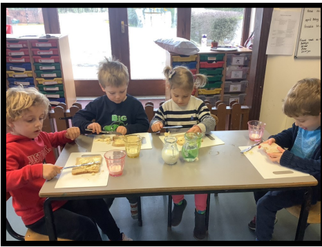
Making egg sandwiches for snack.