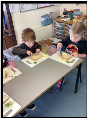
Making egg and cress sandwiches.