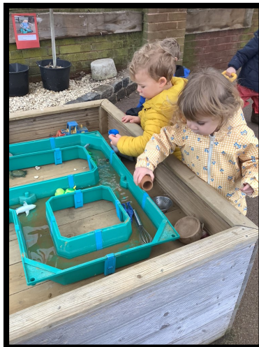
Scooping and pouring