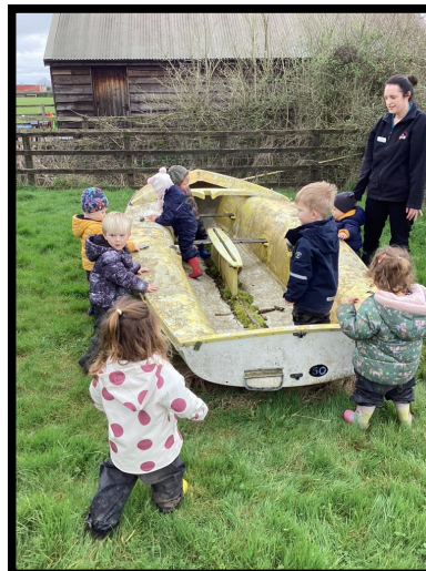
Fun time on the boat in the meadow.