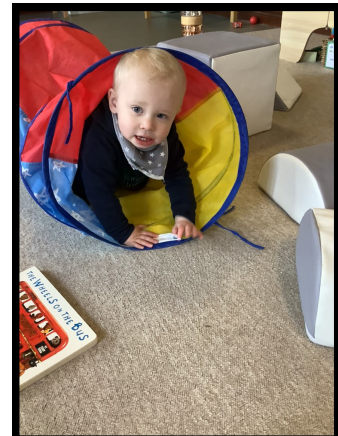
Fun with the tunnel!