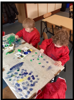
Mark making on the bubble wrap.