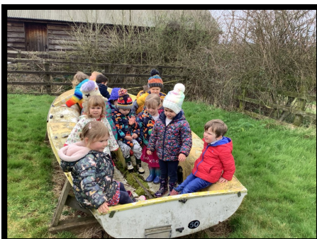
The Little Squirrels Pirates!