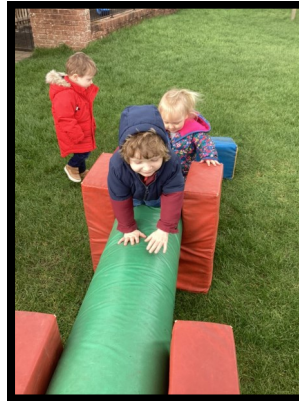
Practicing our balancing skills.